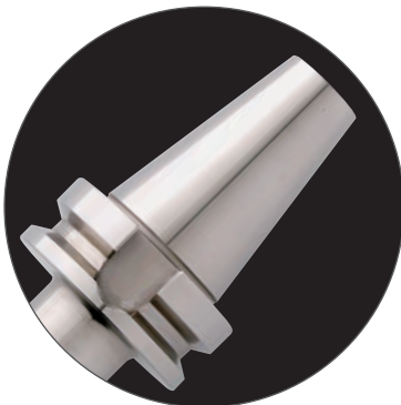
NT's special surface treatment

When the taper area gets rusty, the runout accuracy of the tip of a cutting tool deteriorates by 0.01-0.02mm.