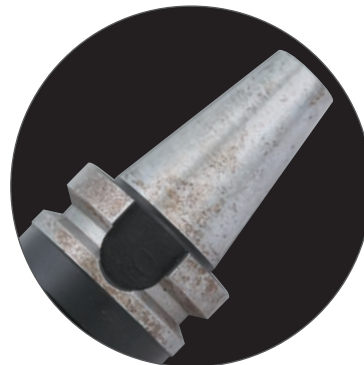
Rusted surface of standard product